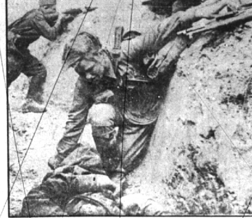
A Soviet field nurse, during the sudden death of the front lines, slides down an embankment to give first aid to a fallen Russian soldier. (Picture from March of Time's "One Day of War.")