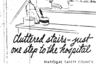
Cluttered stairs—just one step to the hospital