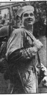
A Seabee—the Navy's jack-of-all-trades—arrives at a South Pacific base, ready to work and/or fight. He's one of the warriors who build advance bases under fire.