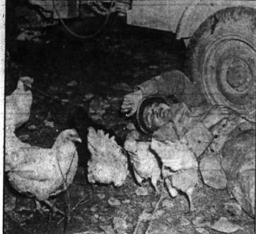
Unaware of his clucking companions, a weary doughboy snoozes peacefully at the end of a grueling day in the 2nd Army's field maneuvers in Tennessee.