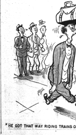
HE GOT THAT WAY RIDING TRAINS ON WEEK-ENDS.