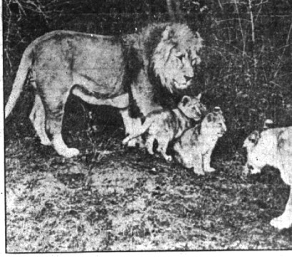
Leo and his wife, together with their family of two cubs, settle themselves comfortably in their new quarters at Whippsand, Eng. They were transferred from London to the safety of the big rural den.