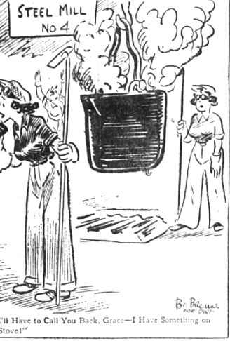
"I'll Have to Call You Back, Grace—I Have Something on the Steel!"

TRANSPORTATION BAVE room for several passengers each morning. Leave Birmingham 8:30 a. m. Woodbury, Phone 218.