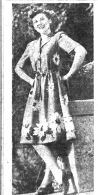
SAVE "CHANGING" Have a wardrobe where you can wear a dress designed by Simplicity, simple to make.

NOW—MESH HOSE Lined up for Spring is a practical assortment of weights and weaves in both cotton and rayon stockings. Most attractive on the leg is a durable cotton mesh, versatile in its ability to be worn "on duty" and "off."