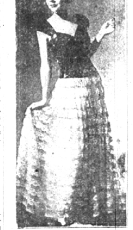
MEMORY PROVOKING: slim jacket crew top with wide shoulder strap and a full skirt of horizontally striped pink lace.

At the other fashion focal point are the dressier clothes; coats, suits, dresses which reflect the inevitable military spirit of the times.