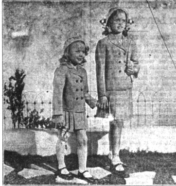
SEEING DOUBLE! Sister-suits made of Crown rayon blended fabric which has passed rigorous tests for tensile strength and dry-shrinkage.

front or button closings, when worn with a harmonizing suit it supplies just about all any woman could wish for. Toppers in five-eighth length, in Shetlands and bright-colored, suede-finished woolsens, are newer than last Season's finger-length coats. No end smart, with new novelty pockets, fancy linings, they are a real boon for ensemble build-