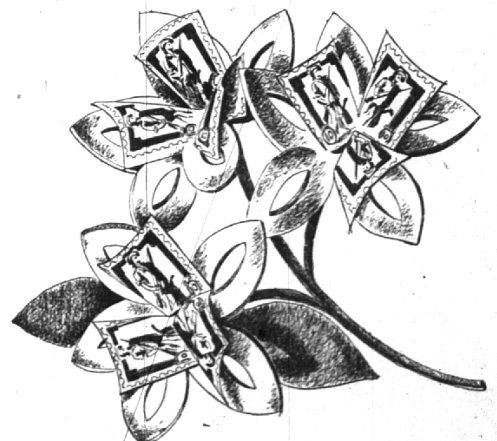
The theme WAR SAVINGS FASHIONS was first introduced by the Fashion Group, Inc., in New York City.