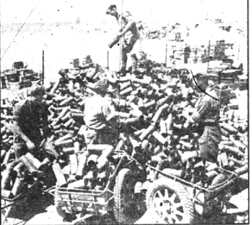
War materials of every kind are salvaged by the British in the deserts of North Africa. Spent shells are cleaned and sent to the base depot, where they will be melted down and used again in the war effort.

propositions, exclusive of amendments, in Michigan No. 1 relative to the calling of a State Constitutional Convention; no harm to come if this wins; No. 2 to give Wayne County Home Insurance, that ought to be approved; No. 3 concerns a State Milk Marketing Act, and, because I think the approval of this will improve the lot of humans and friendly cows, my vote will be "yes."