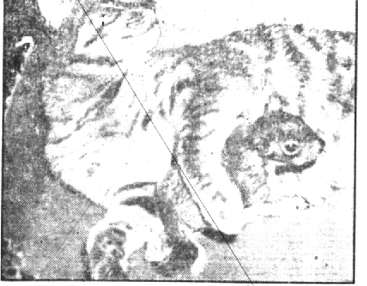
When its auto killed a mother squirrel in front of a New York grocery store, this cat promptly adopted the baby squirrel. The new-come, adopted family includes four sisters.