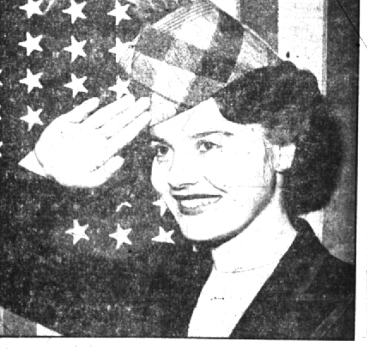
Saluting smartly as she receives final citizenship papers, Olympie Buzina, French actress, commemorates a memorable moment in her life.