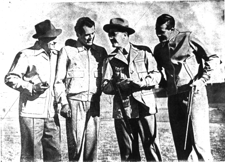
SPORT WEARERS in an man's sport life are these four jackets, whose tough resistance makes them impervious to wind and rain. The chap with the score card wears an authentic "kick" shooting coat, quilted shoulder pad and all. His companion wears a jacket ideal for the casual life, featuring mottled, camouflage pockets for any sports paraphernalia. All are Zero King jackets in Eakle, Tull, a fabric tested for toughness and longevity in college and pro team "ball park" situations, are the practical "dress for the occasion" that will be sought after by men doing air raid duty.

On the Home Front, Weather Resistant Sport Jackets Report for Duty