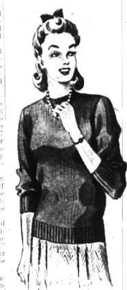
Our Own Exclusive 100% Virgin Wool

materials. First and foremost seen, there are plastics... clear or enameled with a special type of colored materials that glow like paint or treated with radium so jewels and are to be found in that they glow at night. From many animals and gemstones, only a part of the jewelry is forms. Many of them have a "treated" surface of a costly phosphorescent glow in the dark, painted glow, or centers of which puts them in the class of flower sprays.