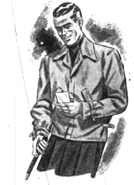
Hollywood Rogue Shirts