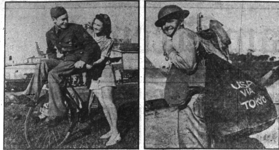
American soldiers in Australia quickly made themselves at home, and have received a cordial welcome from the Aussies. Off duty, many of them are seen in the picture above, some of them are seen in the picture below, some of them are seen in the picture below.