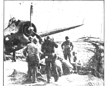
METAL MATS FOR DESERT TAKEOFF—When Anglo-American forces occupied North Africa, topsoil planes took off in the desert on metal mats like this one, which formed temporary airfields.