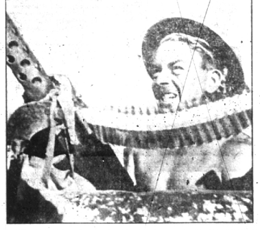
HE ISN'T FOOLING—Aiming his gun at an attacking Stuka dive bomber, this New Zealand soldier with Montgomery's Eighth Army in the western desert punts a hot blaze of machine gun fire at his target. Blurred cartridge belt is caused by speed it is traveling into the gun.