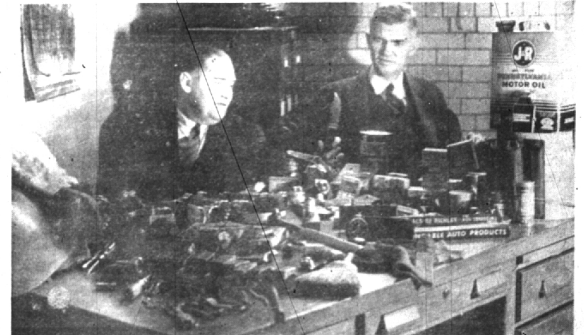
No. 15.—Who are these two peering-looking gentlemen?