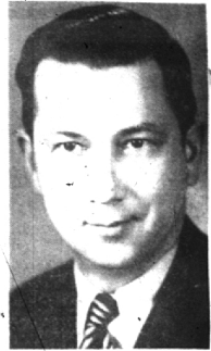
No. 12.—Producer of music.