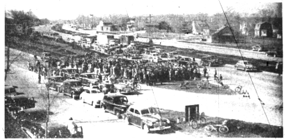
No. 13.—What kind of a tree was planted here, two years ago?