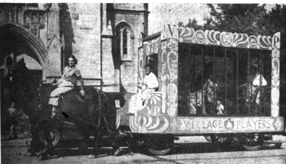
No. 4.—What occasioned this stunt by the Village Players?