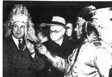
No. 6.—What was the occasion of this whim by Gov. Van Wagoner?