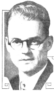
No. 10.—He denies plans to build.