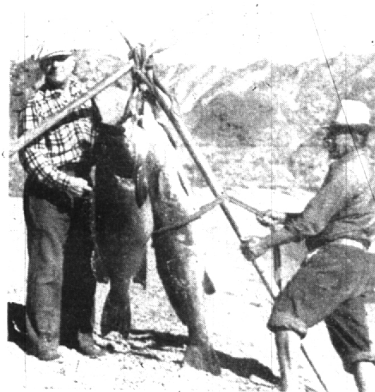
No. 5.—What Birmingham newspaper publisher caught this trout in the Au Sable? Or was it Mexico?