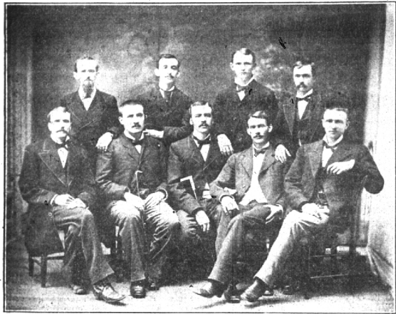
No. 2.—What year was the Eccentric named by this, the Eccentric Club?