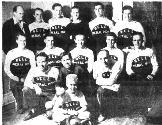
No. 3.—What year did this softball team win the City championship?