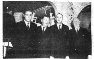
No. 9.—Who are the two "Carusos" in the center?