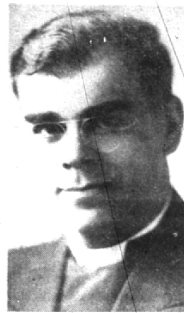
No. 8.—Former Congressman at Bloomfield Hills.