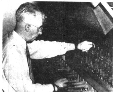
No. 7.—Who is this famous carillonist?