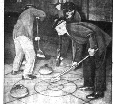
"Drawing" her along when she's "dying."