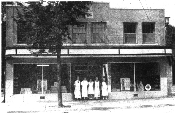
The New Virginia Market Building 608 S. Woodward Ave.

608 S. Woodward Phone B'ham 940 FRIDAY & SAT. • AUGUST 7 & 8