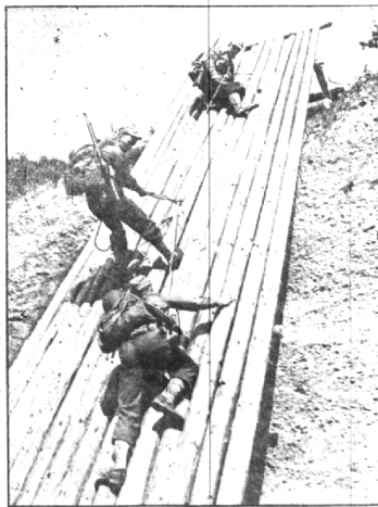
A new branch has been added to Uncle Sam's Army—a full-fledged Mountain Regiment. Last winter these men were the first organized ski battalion in the United States. During summer months they are undergoing rigorous training as Mountain Infantry. Here they scale vertical wooden climbing ramps, 40 feet high and nipped at intervals for hand and toe holds.