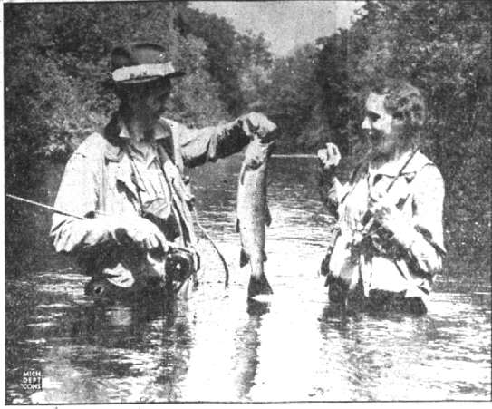
A fitting end to one of the most fruitful fishing seasons in Michigan is the extra fall week of fishing on the schedule because Labor Day this season falls on the first possible date. Abundant rainfall and ground-water supplies have kept streams in good condition. Fishing pressure has been light, because sales indicate an early progress as ever, though on the whole the preference for the fly-fishing and the cool water fisheries like those provided by the Government is still being noted on the famous Au Sable river near Grand.