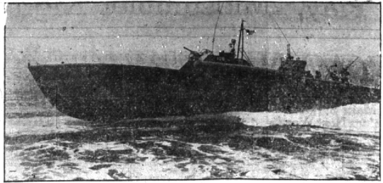
A new type of torpedo patrol boat cuts through the water at high speed during maneuvers off the coast. These vessels have proven their worth in action in Philippine waters, and may be our answer to the submarine menace.