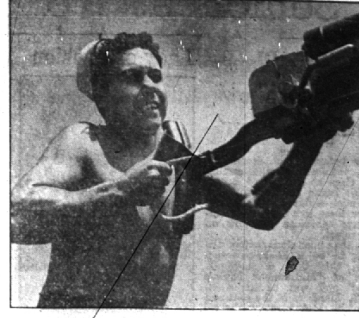
Every muscle tense, teeth gritted in determination, this U. S. Coast Guard man grips his gun in the Battle of the Atlantic, helping to clear shipping lanes of the sub menace.

Roommate located a Detroit swimmer from a lake near Southingham, Ohio.