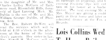
Miss King will also entertain in their home at a buffet supper for members of the bridal party and out of town guests.