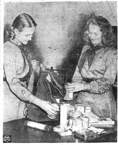
How to travel light and eat well is demonstrated by Girl Scouts who have assembled foods that can be easily carried, and quickly prepared. They keep their eye on nutritive values, too, in selecting knapsack rations. This is all part of their defense training, so that emergencies will find them prepared and ready to be of service.