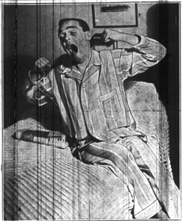
READY FOR BED in wine and gray striped pajamas of Crown Tested rayon tuffes. Casually tailored, they're carefully detailed with slits of room for comfort.