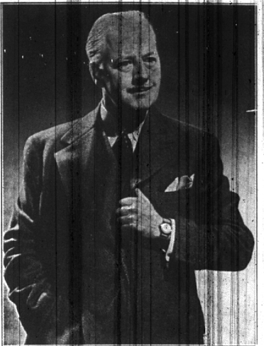
THE WELL-DRESSED EXECUTIVE likes a suit cut with the new semi-drape recently achieved in the Cheviot suit of shaggy imported lamb's wool. The diagonal welt pocket, high for fall, is one of the styled details noted.

The three-button single-breasted jackets with welt pockets will also be in favor with younger business men and with those men who perennially wear the single-breasted jacket featuring no waistline of the dress nor the shading of the basic necessities.