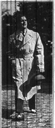
ARMY INSPIRED, this double-breasted trend style raincoat is made of "tough" Crown Treated rayon-corduroy fabric.