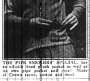
THE FIFTEEN SMOKERS SPECIAL, has an unusual blend of fresh pocket as well as the one size pocket and cuff. Made of Crown rayon, cotton and wool.

Many of the sports coats this fall will be popular in the tan shades worn 3 1/2 with contrasting shades or brown in slacks. In the past the coats saw very much longer in style than those worn in the midwest and far west, though indications are that the longer jackets will move up in favor west of the Mississippi as time goes on. Throughout the country, however, the smaller checked tweeds and small downy plaids are universally tops in fashion, with the flannel and gabardine slacks predominating. There will also be more sports jackets in solid colors this fall than in some time—grays, browns and blues.