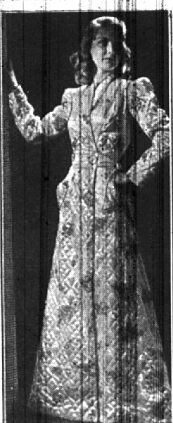
FOR MISMATCH DEVILS: this Multiple Wardrobe jumps skirt to blouse and overcoat with a fabric fastener at the waist. Best garment for an individual to use on a hill.

STORES HAVE NEW STYLES NOW Through these pages is reflected all that is new in the way of fashion. The news stories and the advertisements of our local retailers are the mirrors in which you, the reader, may see the clothes for the season ahead, which will chart a new course for your wardrobe. American from the thread with which they are woven, to the fabrics from which they are made, these fashions have as their background our own colorful and busy history. The present in their inspiration. The present is their source. The present is the time for which they are superbly designed by native American designers.