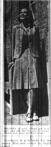
BELOVED of every college girl is a corduroy dress with like stripes, in Crown. Spaced upon rayon and wool thread. Corduroy is a favorite for the young Miss and comes in bright colors.