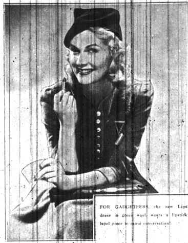
FOR GARDENERS, the new Lina dress in crepe wool, wears a lipstick help piece to ease conversation!

Even the very dressy dresses with high necklines, are made more elegant with the addition of a bib, or bustier.