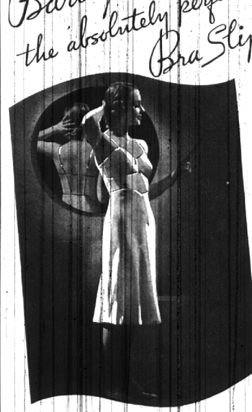
Barbizon designs the absolutely perfect Bra Slip $3.00

Even the very dressy dresses with high necklines, are made more elegant with the addition of a bib, or bustier.