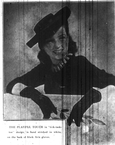
THE PLAYFUL TOUCH in "tick-tack-toe" design, in hand stitched in white, on the back of black Aris gloves.