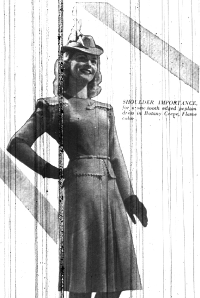
SHOULDER IMPORTANCE. for a new tooth edged pleated dress in Botany Crepe, Flame color.

V ALIANt is the word for America's fashions this fall! Stout-hearted fabrics lend themselves to silhouette strategy. Color cheers men on to defense of femininity's precious importance. And so, in inspiring you to dress beautifully, Fashion makes its own fine effort in behalf of Victory.