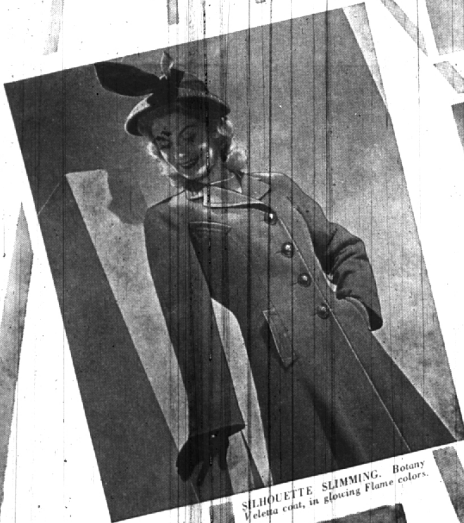
SILHOUETTE SLIMMING. Botany velvet coat, in glowing Flame colors.