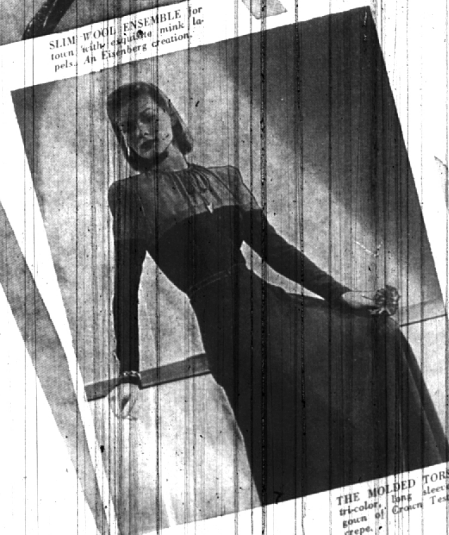
THE MOLDED TORSO in a tricolor, one-sleeve dress of Crown Tested rayon crepe.

V ALIANt is the word for America's fashions this fall! Stout-hearted fabrics lend themselves to silhouette strategy. Color cheers men on to defense of femininity's precious importance. And so, in inspiring you to dress beautifully, Fashion makes its own fine effort in behalf of Victory.