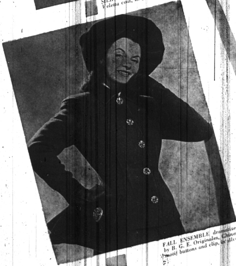
FALL ENSEMBLE dramatized by B. G. E. Originals. Chinese smooth buttons and clip collar.