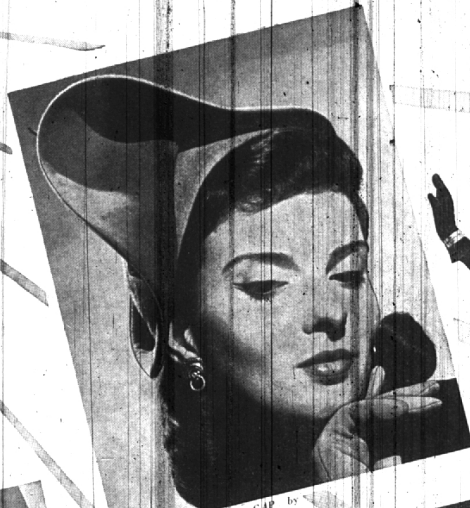
ELFIN SKULL CAP by Gladys & Belle, with an up-sweeping to frame pompous hair bangs.