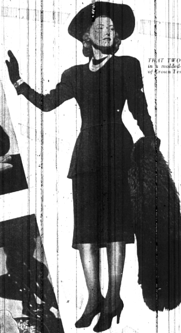
THAT TWO PIECE LOOK in a molded-top tunic dress of Crown Tested rayon crepe.