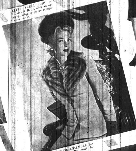
SLIM WOOD ENSEMBLE for town with satinlike pink lapels. An Ellstrom creation.