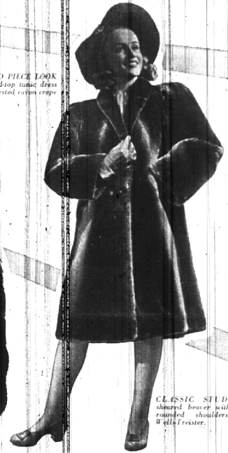
CLASSIC STUDY in shagreen beaver with soft, rounded shoulders. By H. Ellstrom.