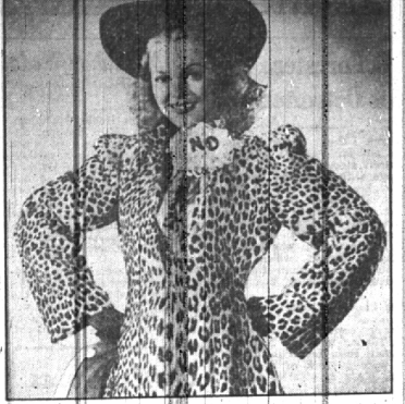
Styled with the new deep armhole and fitted waist, the smart new leopard coat worn by Jane Russell in 'Black-Over' for fall.