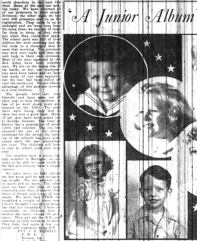
'A Junior Album' Presenting young people of Birmingham, Bloomfield Hills and Franklin... Business and social stars of the future...