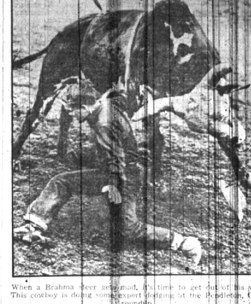
When a Brahma steer grazed, his time to get out of his way. This cowboy is doing some expert dodging at the Bendleton, Ore., roundup.