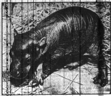
Smallest baby pygmy hippopotamus is this little fellow, smaller than a puppy, brought to the United States from Liberia, Africa. It is a perfect scale model of the big fellows you see in the zoo.