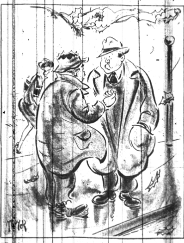
"Brother, could you spare eleven cents for a piece of pie and sales tax?"