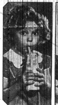
Shirley Temple, 1930 and 1941. She and mother argue about these baby curls.

THE movie news of the day is that Shirley Temple is coming back to the screen. Faded with the problem of making good with boxoffice managers, who measure hits not by their artistic merit but by what they put into the cash box.