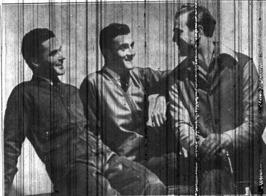
THREE SMART BOYS: one in brushed-cotton leisure sweater with change pocket, second with breaking view and lockable flap in smooth, double-breasted jacket, third in three-button sport jacket.

of 1941 will see no radical change in either the fabrics or styling of such accessories as shirts, ties, sweaters and the miscellaneous odds and ends of haberdashery that lend distinction and variety to the masculine ensemble. The important innovation in the upcoming popularity of bright and contrasting color combinations, especially in sports wear, and it is here that the patriotic motif should be prominent.