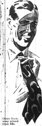
Other Neckwear priced from 65c.