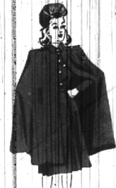
INGENIA OF FASHION, and of the new to be used in one shoulder of this season's new coat with little turn of these collar. Wear the jacket and such accessories.

Some women with clever fingers are repeating the button motifs on their dresses with a bracelet of buttons. Usually these are of the same type and they can be sewed to an elastic band, or threaded through with a colored cord which tucks in a bow.