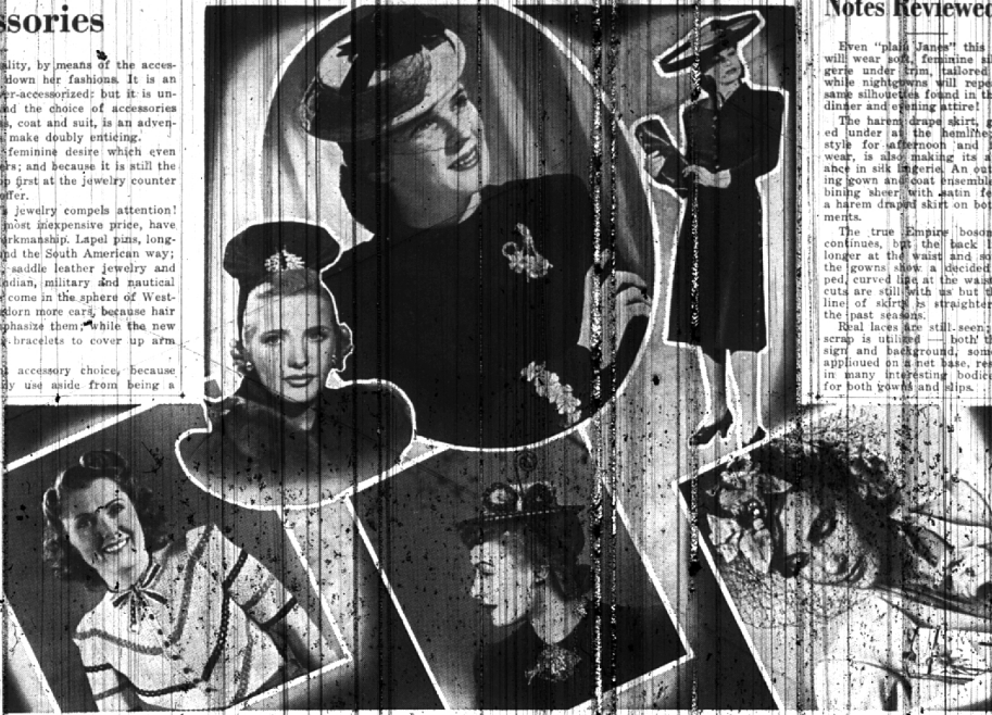
Top, left: She wears a little hat and simple dress with ruffled hem, pink and matching buttons. (Based on a card to make the costume better.) Bottom and right: "Circles." Center, left: Princess Lace, Warner Bros. star, chooses an off-the-face hat to show her composure. And just the right shade of Wesmore makeup enhances her face, which her wig has interest. Bottom, left: Madeline chooses her adult evening gown around the waist. Bottom, right: Madeline chooses a pair of trousers with red and blue stripes on white. Top, right: Child "bag" shoes, dress. Center, below: The "Vaseline" plastic shoe seen in the picture of the necktie. Bottom, right: Madeline chooses a pair of trousers with red and blue stripes on white. Bottom, right: Madeline chooses a pair of trousers with red and blue stripes on white.