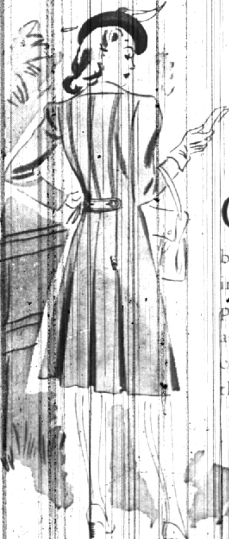
Misses and Women's Sizes.

CHOOSE your coat as you choose a friend. It must stand by you in all weather, flatter you in all your public appearances, call people's attention to you as well as itself! The excellence of these coats' tailoring is surpassed only by the attractiveness of their styling.