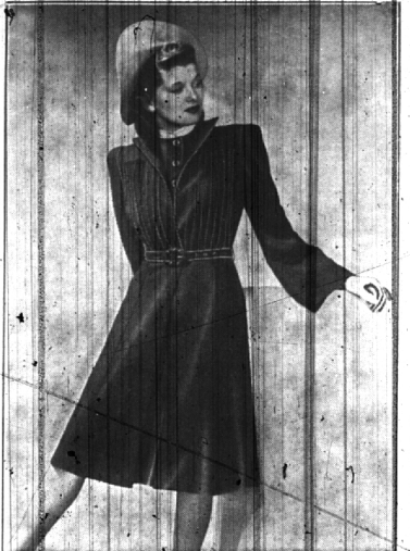
SOFTLY TAILORED figure flatters suit. The coat is tucked and tucked with a double breasted dressmaker suit with a matching rain dress has crisp pleated open collar and waistline.