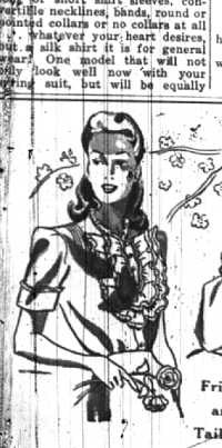
Frilled and Tailored

You still have your choice of long or short shirt sleeves, contrasting necklines, round or pointed collars or no collars at all — whatever your heart desires, in a silk shirt it is for general wear. One model that will not only look well now with your spring suit, but will be equally