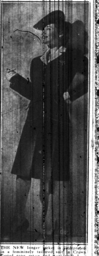
THE NEW longer jacket is sported in a femininely tailored suit in Crown tested open collar and waistline.