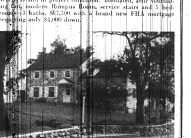
Finest—your Country Place in Bloomfield Hills! A "Farmhouse" in Farmhouse brand—new stone construction, 13 acres—trees—rolling meadows; a Hill Top view—no dusty roads—low taxes. Yes!—the "TOPS."