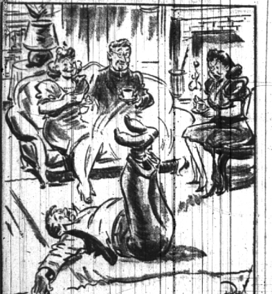
Henry, why don't you just TELL Rev. and Mrs. Willowisp how you lost the eight pounds?