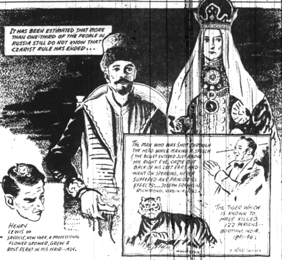
The tiger was in the habit of raiding small villages, killing and maiming of women and children. Curiously, it killed only one man. Lewis caked his hair with dirt, planted seed, raised roses within four months by forcing. He still has three of the roses pressed in a book.