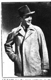
AT-EASE for the great outdoors, is this camel hair coat with railroad stitching and concealed slide fastener.