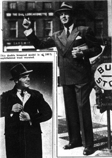
This double breasted model is of 100% sophisticated wool worsted.