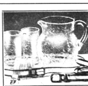
EARLY AMERICAN SANDWICH GLASS inspires new belts and braces. The pliable belts above go with an outer garment because of their transparency. And the cracked effect characteristic of Sandwich glassware gives them a precious look. Belts by Pioneer.