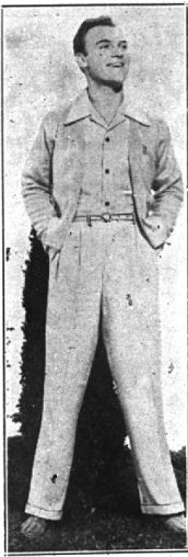
RELAX between classes! Casual comfort and good appearance are the "motto" for college men this fall. The new ensemble above, of Crown Tested Snow Rayon, is equally suitable for leisure study or between-class sports.

Tail coats, which are increasing in popularity, and are now a part of the wardrobe of many college men, are also to be seen in midnight blue instead of the former black. Most of these, like the dinner jacket, are of plain color worsted, although some of them have a small interwoven herringbone design. The tail coat, unlike the tuxedo, should have a satin lapel and call for a single-breasted three-button white pique vest.