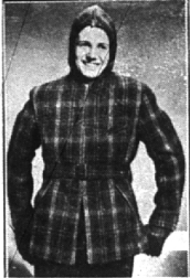
THE HOODED SURCOAT has three slide fasteners—one on the body of the garment, one to release the hood as a big collar, and one on its own pocket.

Idle Basements Are Put to Work By partitioning of the basements of old and new houses, the idle spaces in many cellars can be put to useful purpose. Following the preparation of a careful plan, a number of improvements to the basement are possible with funds obtained from qualified private lending institutions under the Modernization Credit Plan of the Federal Housing Administration.