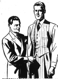
INTERNATIONAL TAILORING CO. NEW YORK CHICAGO

Because lack of height is a sensitive point, Mr. Burger takes orders on a strictly confidential basis, and in instances where Staturaid is ordered by mail, they are delivered with only the recipient's identification on the package.