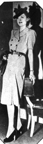
New York introduced this gray wool dress with brown beaver hat and muff in an effort to win Dame Fashion to U. S.

A RADICAL change in the hemlines of the nation's skirts means all the difference in the world to textile manufacturers.