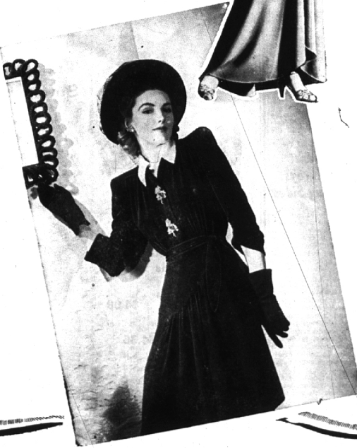
Cost for an entrance (direct), above, a swirl of silver for framing the face and washing luxuriously at the neckline. Of brilliant colored wool, it is lavish in its use of precious Franks Silver Fox.