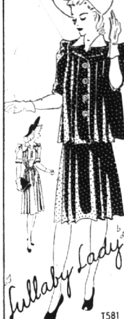
Lullaby Lady T581

Our newly styled "LULLABY LADY" dress and smock combination in polka dotted RAYON. The dress is complete—styled with six pleats to adjust desired fullness. The matching coat smock has a detachable SHARK-SKIN collar. Brown, royal, navy, green. Sizes 12 to 20