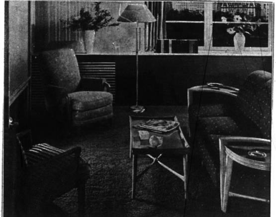
Graciel is the word for Modern, in new furniture contours and in the soft colors and pleasant textures of carpets and rugs. Above, textured floor coverings and modern furniture for dining room. Below, the fitted surface of the carpet shown. Above, repeated in the texture of the interesting chair in the left foreground.