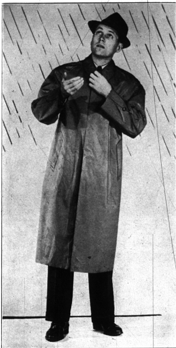
Lenny Ross, popular Columbia Broadcasting star, doesn't mind the rain when he can get into this featherweight raincoat. It weighs just 34 ounces, and its Crown Texted rayon fabric is sooth plaid.