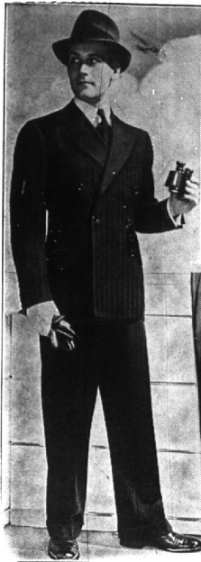
Looking, perhaps, for the first hints of spring, this soft dressed young man wears a double breasted business suit. Made of an all-wool material of worsted fabric, it is one of the newly popular striped, unapertained wool fabric.