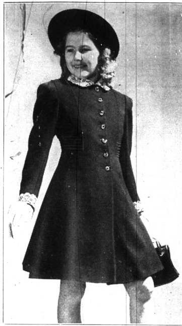
All dressed up in her best coat! White lace collar, smoked pearl buttons and tiny pin tucks to define the waistline are growing details. Because this coat is of 100% mottled wool fabric, it will shed wrinkles.

SLIPS SHOW THROUGH Snuggly fitted camisole slips of sanforized batiste, mullin or fine muslin are the smartest choice for wear with the new transparent blouses.