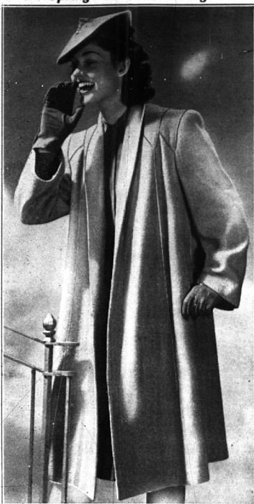
As breezy as the season, this coat of Beano has sewing detail to emphasize its casual-good lines. The shawl collar is newly flattering, as is its light hue which can be worn over tailored and soft hosiery.

socks the most colorful ever seen! Greens have gained steadily in popularity, but blues and tans, grays and purplish tones all contrast well with the new suitings. Rayon appears more often than ever, cotton and wool mixtures are