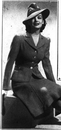
Designed as a sports twin, this town and country suit has a pocket trimmed jacket equally good with slacks, white or skirt will take to odd blouses, sweaters and alternate jackets. Tailored of Botany woolen, gay with nubby weave.

ADD A TOUCH OF FUR Fur scarfs, capes and jackets will be spring's most dramatic accessories.