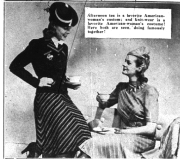
Afternoon tea is a favorite American-woman's custom; and knit-wear is a favorite American-woman's costume! Here both are seen, doing famously together!