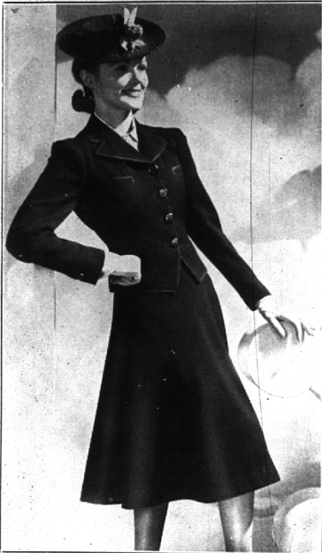
Braid trimmed edges give sculptured outlines to the brief jacket of this slim dressmaker suit. It's doubly important, because it's fashioned of napped woolen twill spring's important fabric revival!