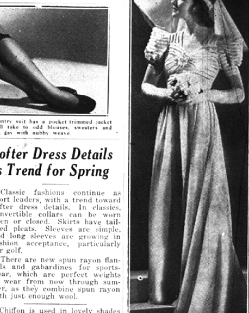
A horizontally striped blouse makes this white silk chiton wedding gown most demure.